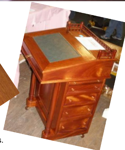
A couple of the outstanding entries.