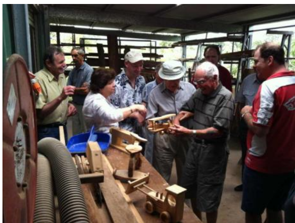
Some of the boys from Care Cottage paid a visit.