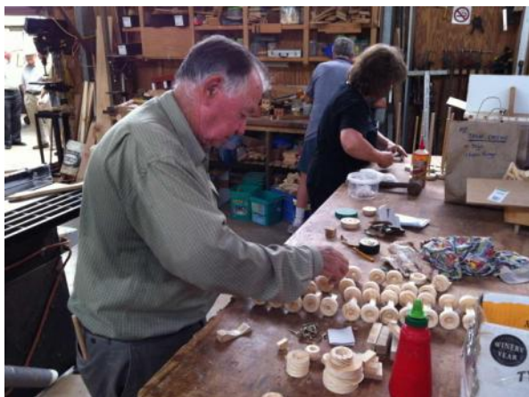
The Elves in the Toy Dept are flat out finishing off the toys for the Salvo's to collect on Sun 17th.