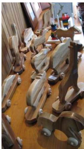
Around the Santa Shop held at Monteville on 4/5 December