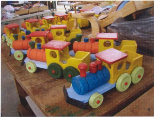
Some of the colourful wooden toys made by the Blackall Range Woodcrafters Guild on Queensland's Sunshine Coast.

Families receiving the toys include those which have been hard hit financially, single parent families, those with sick children, families dealing with grief and loss and those with a range of other needs.