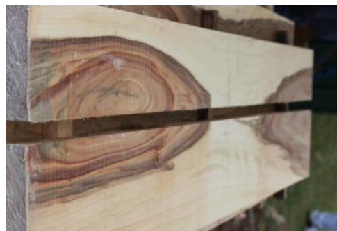
And the results were very satisfying.