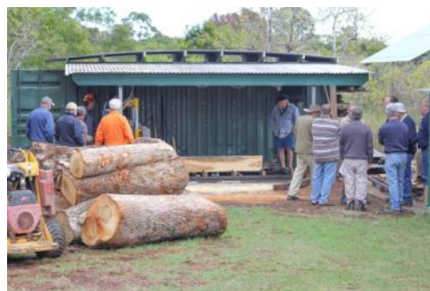
The crowd gathered for the first day of slabbing with our new saw.