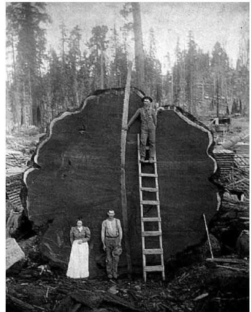
Now that was a tree!