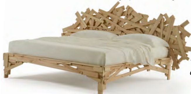
This is what Hamish is really doing with the off cuts!!!!