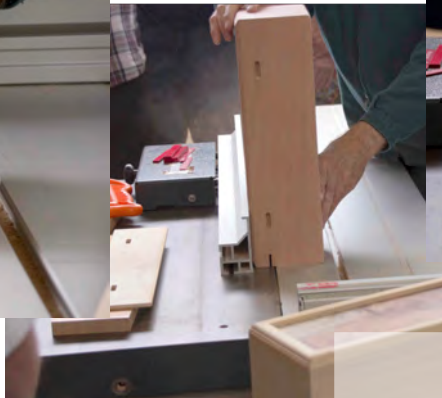
Rob demonstrated two methods of accurately removing the lid from a box....note the Domino holes ready for installing the hinges.