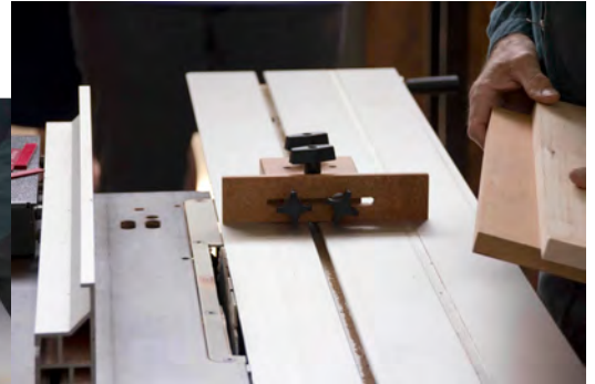
This jig is for repeatedly and accurately cutting thin strips.