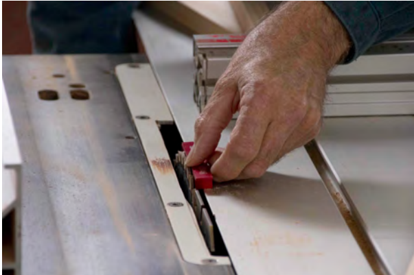
Rob demonstrates the use of a gauge block set to accurately adjust the cutting depth of the blade.