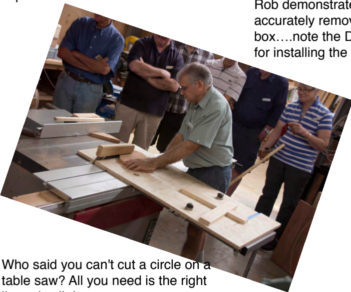
Who said you can't cut a circle on a table saw? All you need is the right jig and voila!