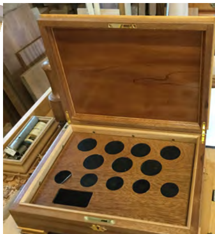
Rob Otto produced a set of five matching display boxes for a Coin Collector