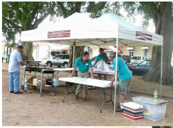
A great job done setting up the BBQ