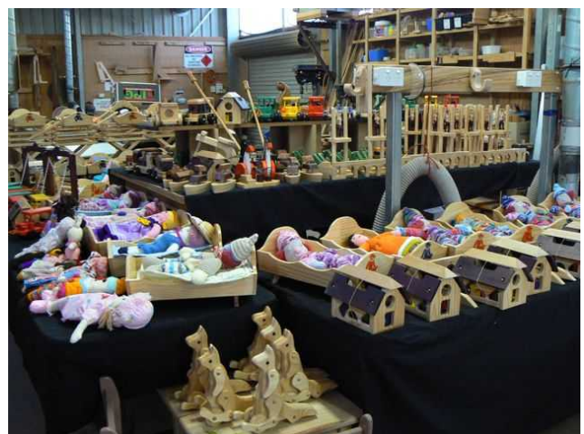
Some of the toys

Some 340 toys were on show at the Christmas Party.