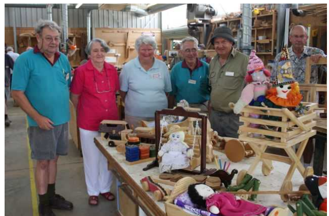
Some of the boys ('n' girls)