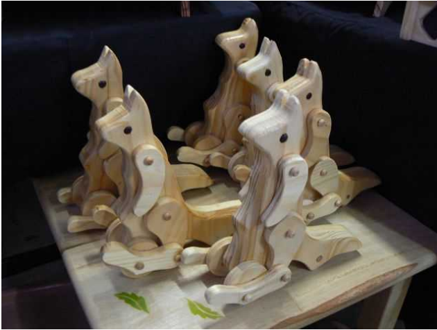
We said the Shed was hopping!