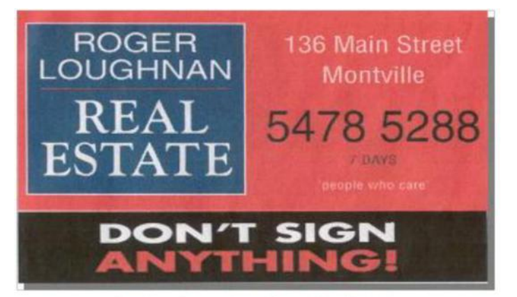
Contact Roger Loughnan Real Estate for the largest range of exclusively listed properties on the Blackall Range from $100,000 - $2,000,000. Actively supporting our community