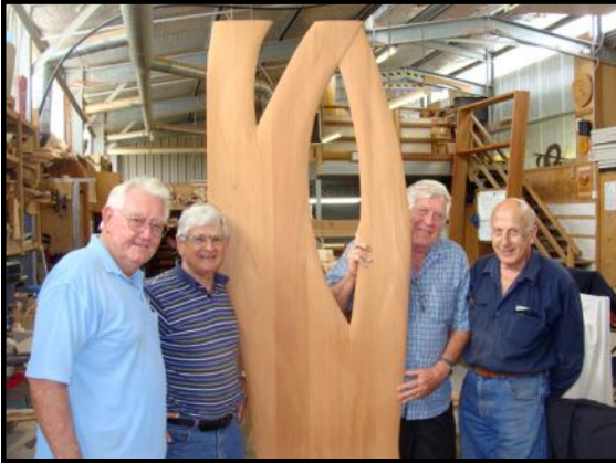
Now.. That's a tree