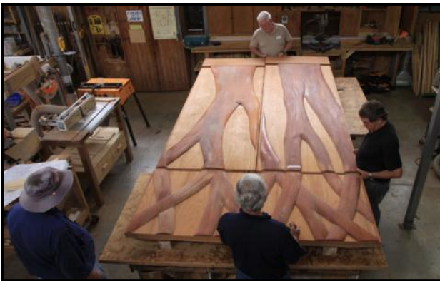
Do they match up??