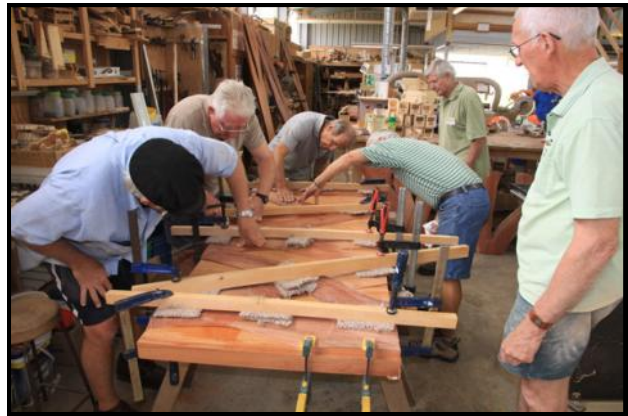
Any spare clamps??