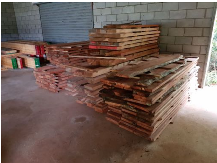
More wood in strip at Western Ave. Beautiful silky oak. Thank you Sundale for the use of this great facility and thanks to the efficient millers