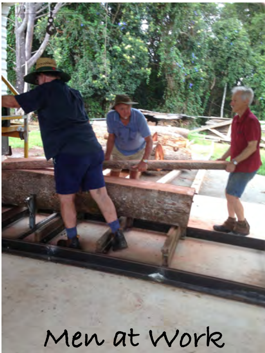
Men at Work