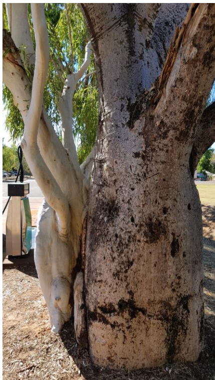
Two interesting trees in Derby.

Cornhole is a game introduced to me by my son who visited Tampa, Florida, hence the Tampa football stickers. The idea is to throw a small sack of corn kernels into the hole at the top of the board, and build your score. A great outdoor game, with a drink in one hand and the corn sack in the other. Just like Finska!. Just be sure to toss the corn sack and not the drink!