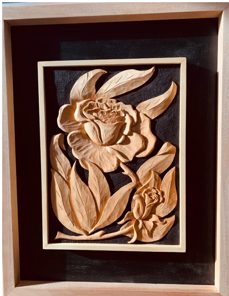
Wall Carving by Dave Southern.