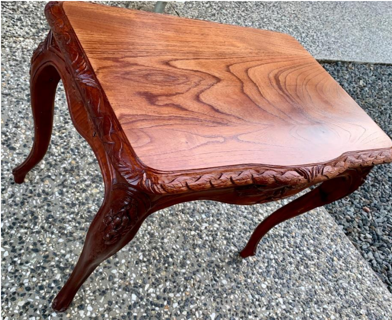
Carved Red Cedar table by Dave Southern.

Some examples of the amazing talents of our Woodies!