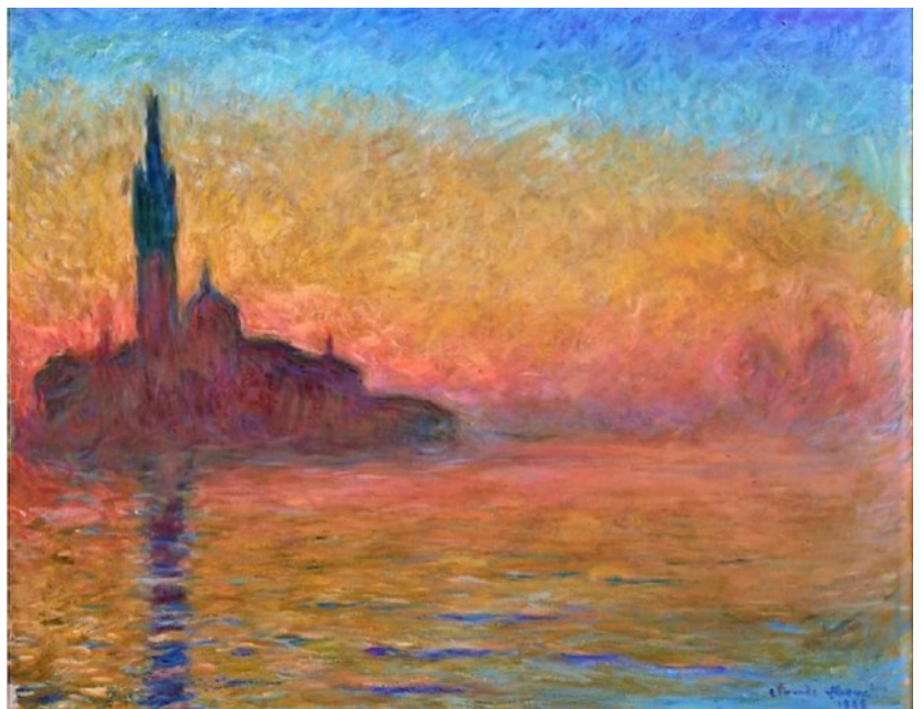
Monet: "The Crepuscle, Venice"