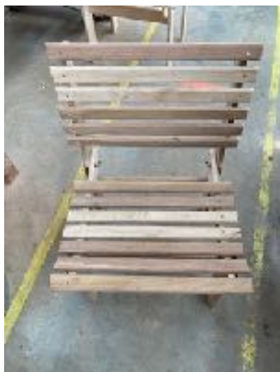
Chair for outdoor area of Henderson Building Chairs are being made from Tallow Wood.