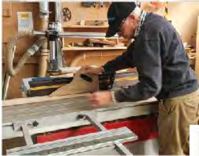
This guide can be used on a bandsaw or router