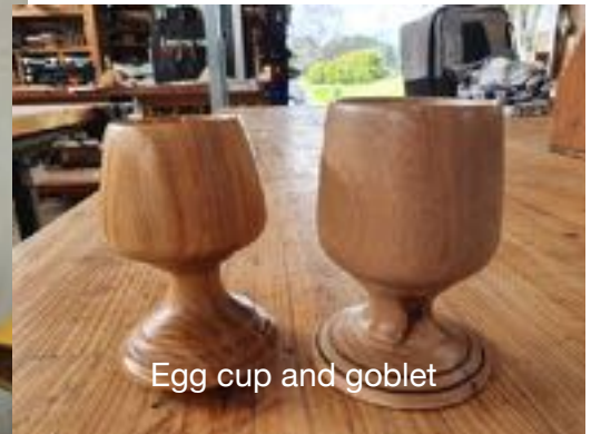
Egg cup and goblet