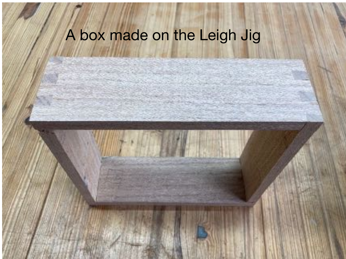
A box made on the Leigh Jig

**** REMEMBER IF YOU ARE UNSURE HOW TO USE THE EQUIPMENT**** ****THEN ASK FOR HELP ***