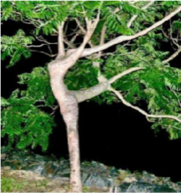
A dancing tree