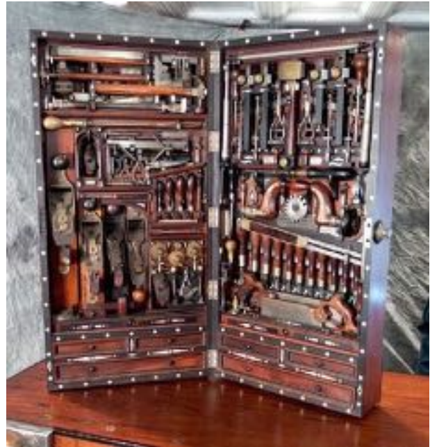
The Studley Toolbox in all of its organized glory (created between 1890 and 1920). This beauty is 20×40 inches when closed (40×40 inches when open) and contains 300 tools within its carefully crafted mahogany rosewood, ebony, and mother-of-pearl case. The tool chest was created by mason, carpenter, and piano maker H.O. Studley. Born in 1838 in Lowell, Massachusetts.