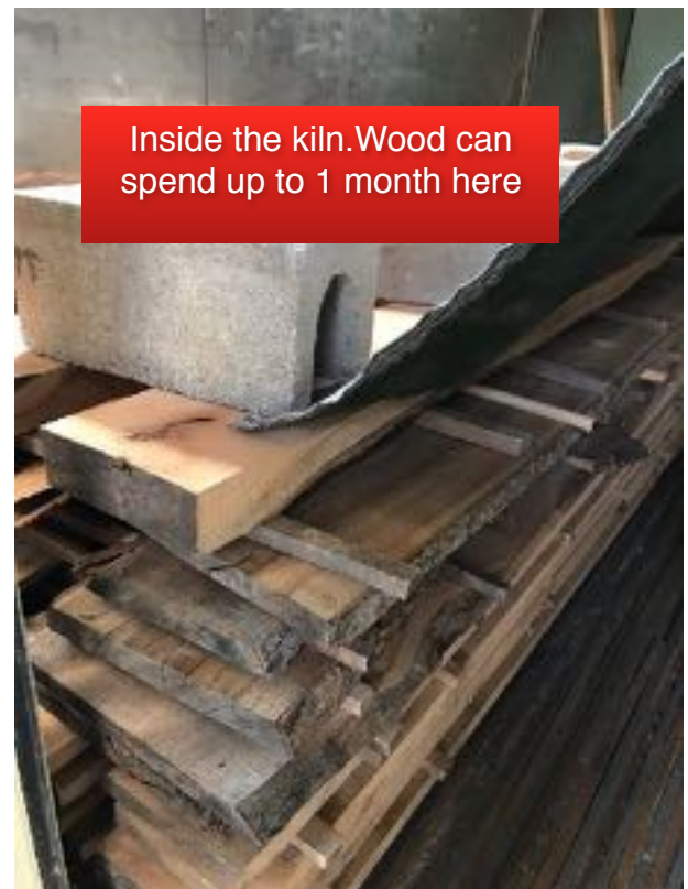
Inside the kiln. Wood can spend up to 1 month here