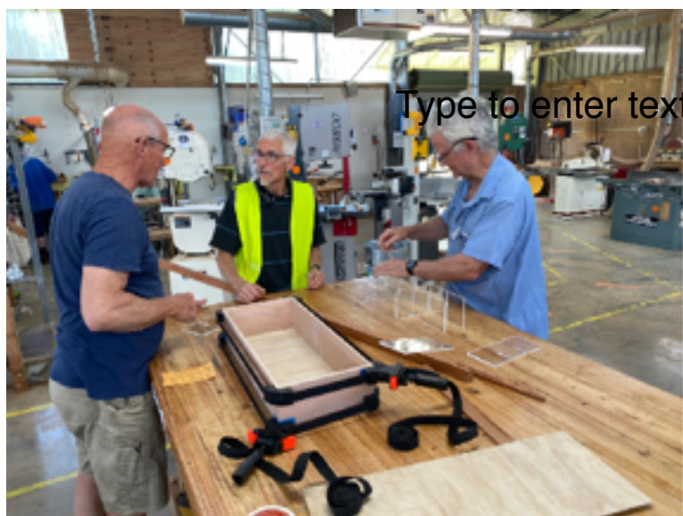
Type to enter text