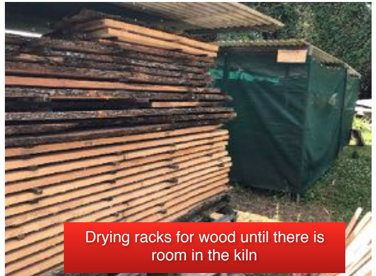
Drying racks for wood until there is room in the kiln