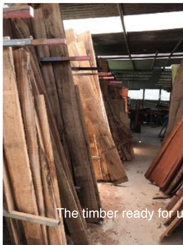
The timber ready for use