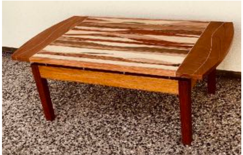
Dave Southern's tables