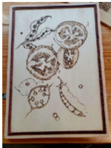
Phillipa's pyrography demonstration