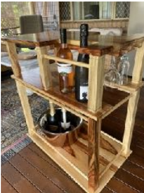
Geoff Coughlan's drink trolley