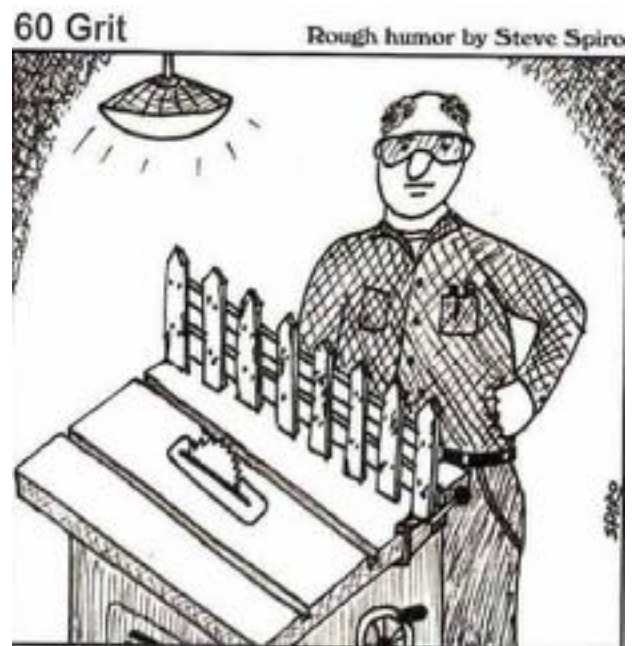
Ray still used the old style fence for sentimental reasons.