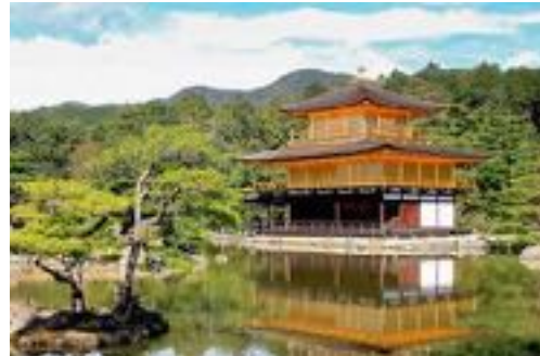
The Golden Pavilion, Kyoto

The peak of fall foliage usually comes in mid- November