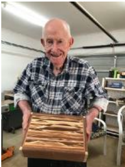
Tony's box and rose