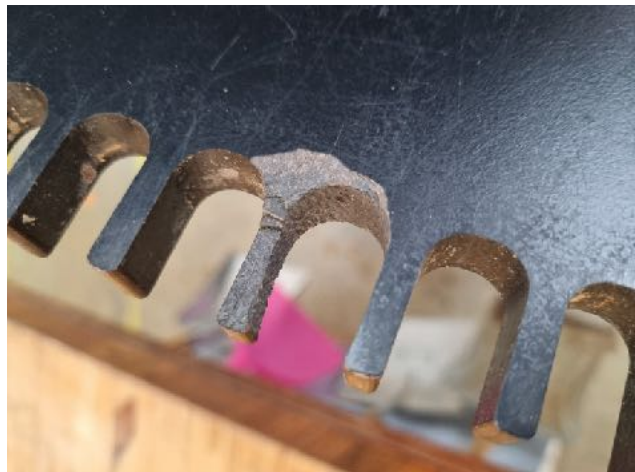
The F5 Gifkin template that no-one noticed.