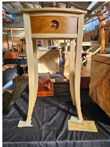
Neil Clarke Joinery Open