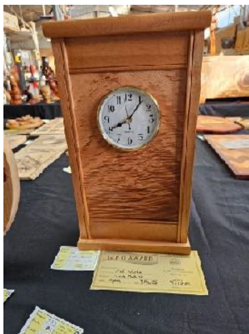
Neil Clarke Clockmaking Open