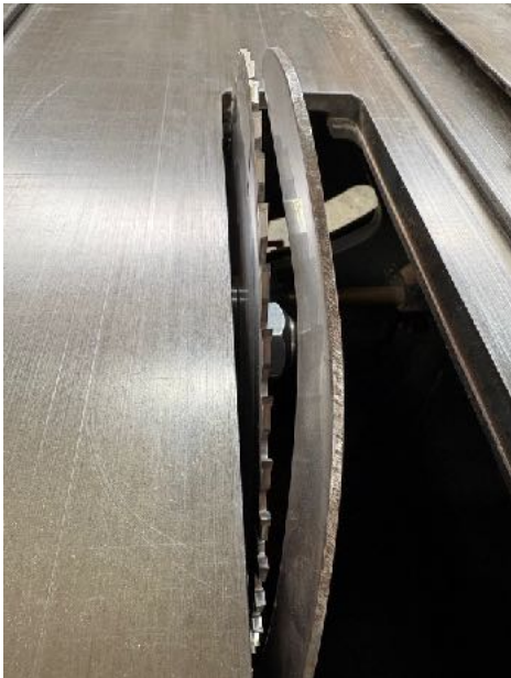
The TS1 riving knife that no-one noticed.