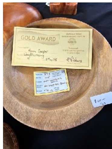
Norm Cooper Turning Novice