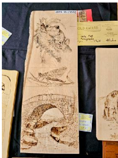
Lesley Mott Pyrography Open