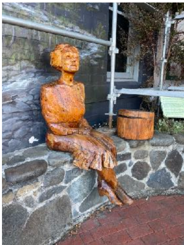
Huon Pine Sculptures in Geveeston Tasmania