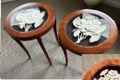
Dave Southern's tables