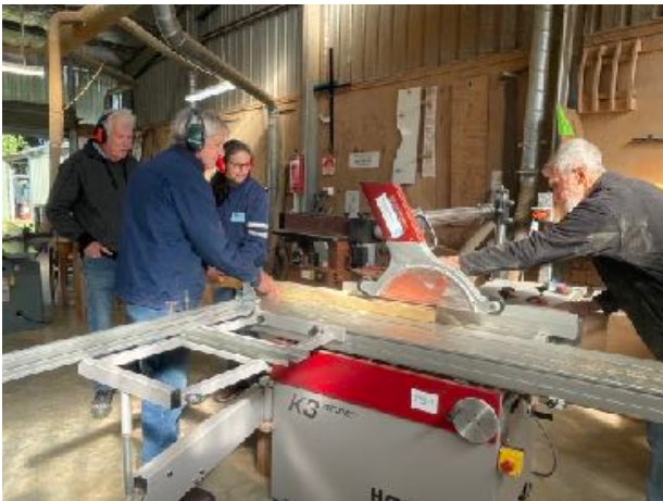
Preparing timber for the benches