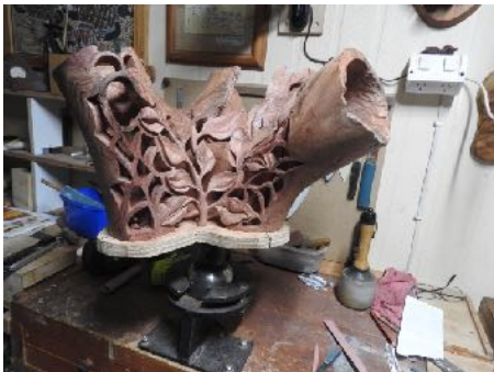
Kaz Depczynski's set up for holding and moving a complex shape