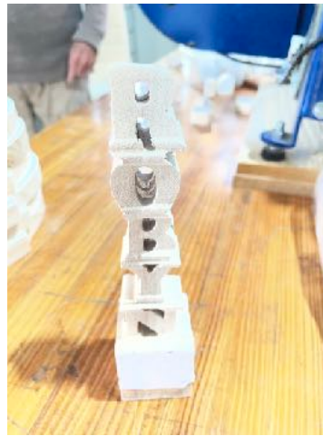
Side 2 of the same piece